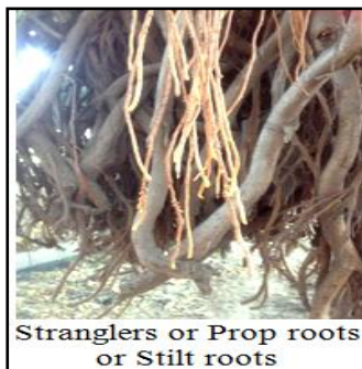
Stranglers or Prop roots or Stilt roots