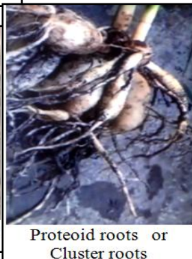
Proteoid roots or Cluster roots