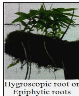
Hygroscopic root or Epiphytic roots