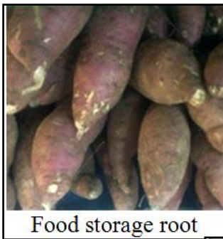
Food storage root