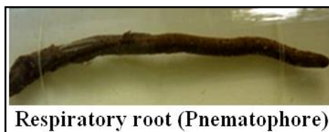
Respiratory root (Pneumatophore)